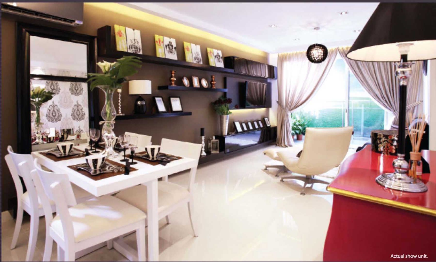
Actual show unit.

“Family bonding, comfort and growth begin right here.”